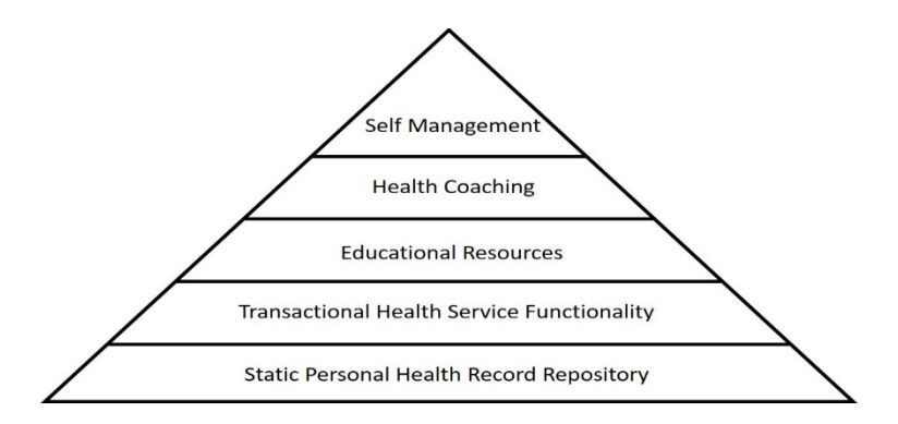
Figure 1: Consumer Health Hierarchy of Needs