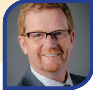
The Honourable Terry Lake , British Columbia Minister of Health

8:00 – 9:00 am OFFICIAL OPENING / OPENING REMARKS Salon A/B/C